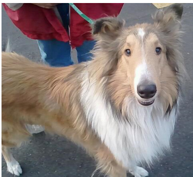
Charlie, a 1-year-old collie, was 15 lbs. underweight when he came into our care.

You can donate through our web site, dog-rescue-iowa.org on our "Donate" page. Or send a check to: Dogs Forever, 809 Rockford Road SW, Cedar Rapids, IA 52404. Dogs Forever is a not-for-profit 501(c)(3) tax-exempt organization. In addition to an outright donation, you can sponsor a dog kennel at Safe Place for a $100 donation. Contact us for more information. Your donation is tax-deductible. On behalf of Eastern Iowa's homeless dogs, Thank you!