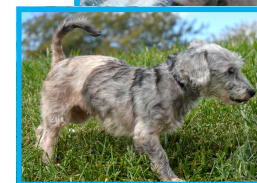
Vegas suffered from neglect (left). Today she is living happily ever after (above).